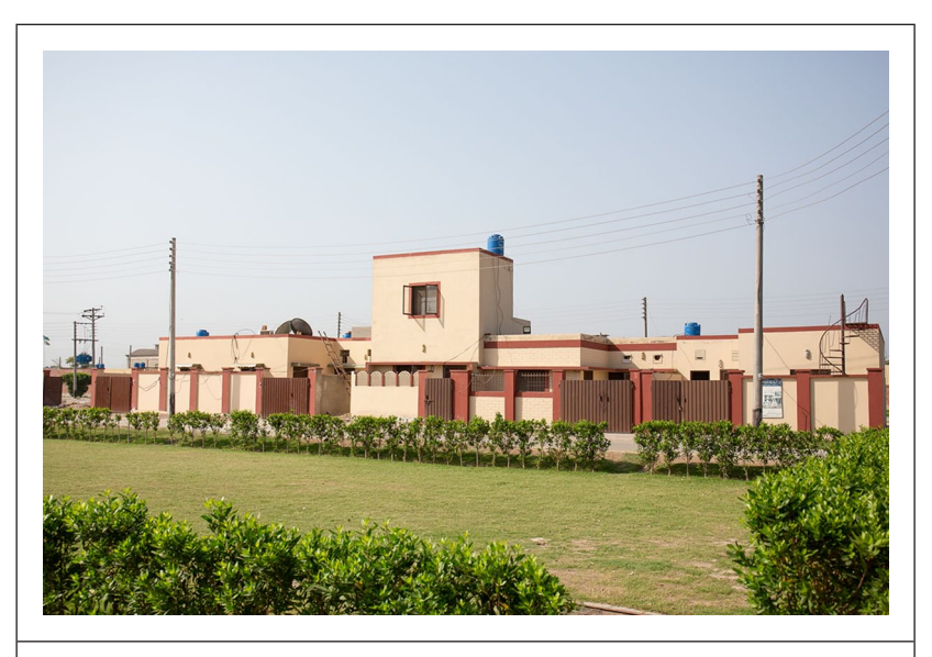
PHOTO 5 AMC-built housing and community spaces in Faisalabad, Pakistan