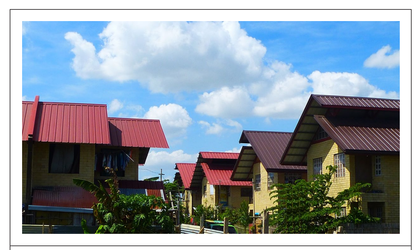
PHOTO 2 LinkBuild-built house in San Isidro Municipality, the Philippines

and much of the land is moderately or severely eroded. Despite various land reforms, significant numbers of rural people remain landless, and there is a swelling urban population living in informal settlements." While considerable swathes of lands have been redistributed, "some of the most productive and fertile private agricultural lands remain in the hands of wealthy private landowners. Lack of access to land and natural resources by most of the population is a key cause of poverty, a driver of conflict and an obstacle to development." For more, see LandLinks (2017).